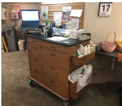
Franke Tobey Jones Old Medication Cart Solution